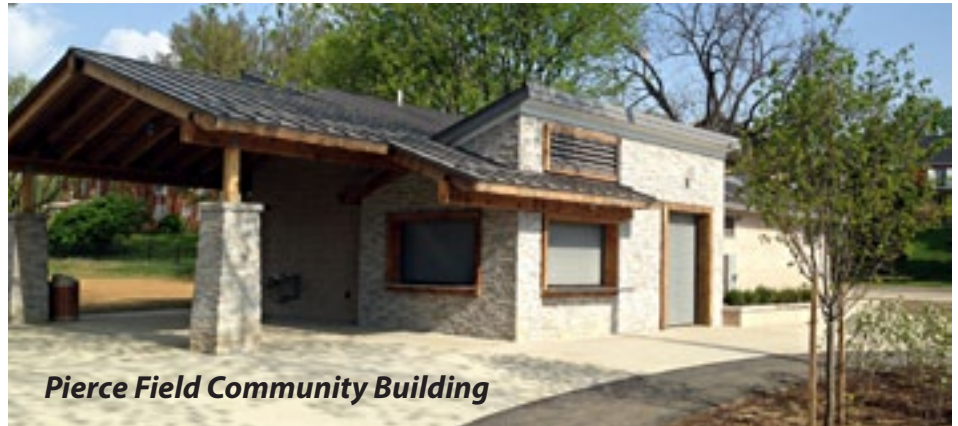
Pierce Field Community Building

for 2015. During the spring months, watch for a new statue and supporting amenities at Memorial Park, located at the intersection of Northwest Boulevard/W. Second Ave. and Oxley Road. The statue will depict a WWII soldier honoring a fallen comrade and preparing to move forward to continue his duty. The project will include a new Blue Star Mothers logo and additional concrete work in the center plaza of the park, and a base to mount the statue on. The base will be made of Ohio limestone. Part of the expanded concrete plaza will include a space where engraved 4"x 8" pavers will be installed, honoring family and friends of area residents who have served in