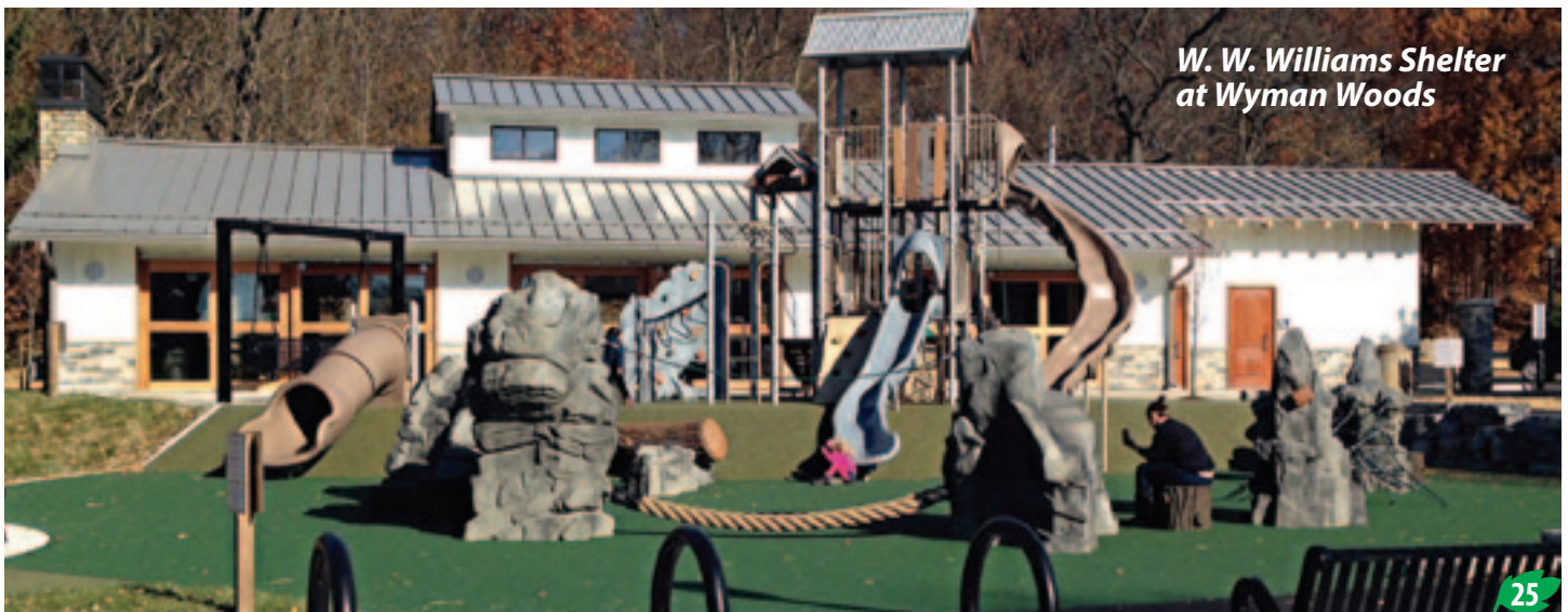
W. W. Williams Shelter at Wyman Woods

Finally, 2015 is expected to see the beginning of design process for a new municipal pool. We are still early in the process, but watch the city's website and the Tri-Village News for updates on the design process and for opportunities to participate.